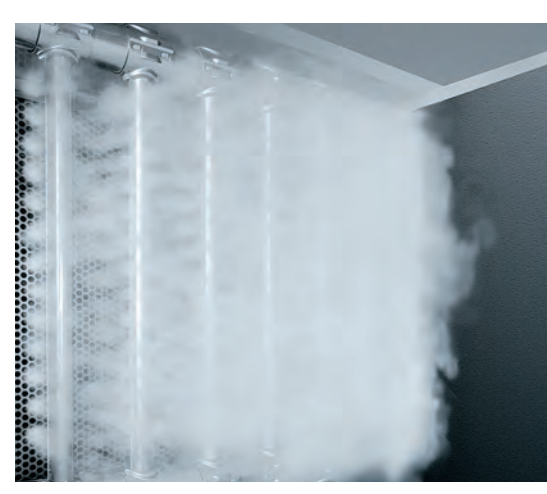
The hot dry steam is absorbed quickly and uniformly by the air stream.

The design of the distribution manifold with its many outlets allows precise steam introduction across the entire duct.