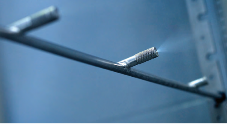
High pressure humidification